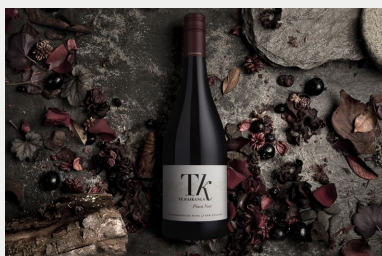
Te Kairanga Martinborough