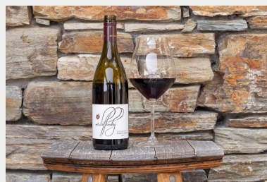
Mt Difficulty Central Otago