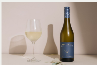
Grove Mill Wairau Valley, Marlborough