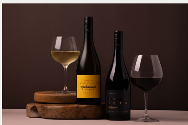
Martinborough Vineyard Martinborough