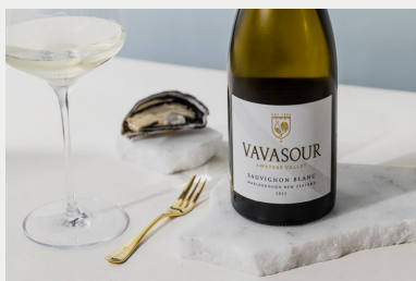
Vavasour Awatere Valley, Marlborough