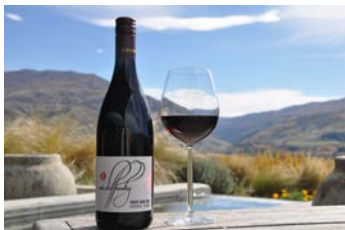
Mt Difficulty Central Otago