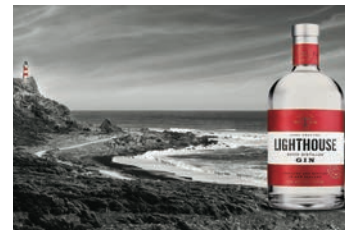
Lighthouse Gin Martinborough