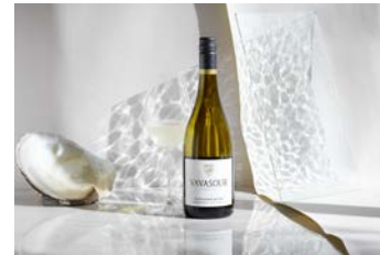
Vavasour Awatere Valley, Marlborough