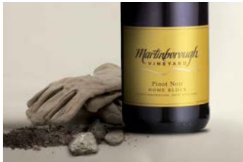
Martinborough Vineyard Martinborough