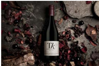
Te Kairanga Martinborough