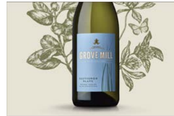
Grove Mill Wairau Valley, Marlborough