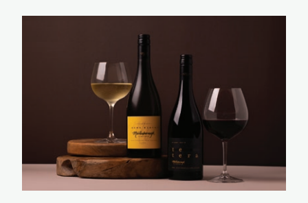
Martinborough Vineyard Martinborough