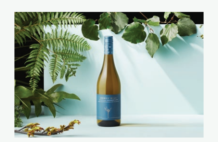
Grove Mill Wairau Valley, Marlborough