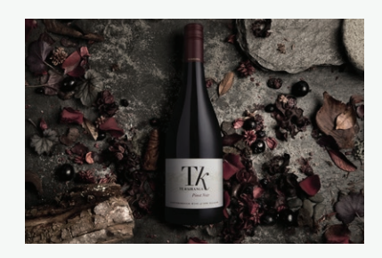
Te Kairanga Martinborough