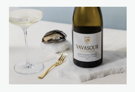
Vavasour Awatere Valley, Marlborough