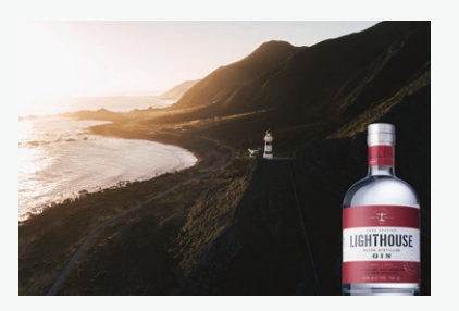
Lighthouse Gin Martinborough