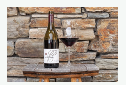
Mt Difficulty Central Otago