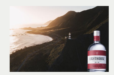
Lighthouse Gin Martinborough