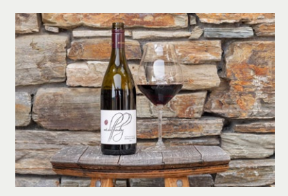
Mt Difficulty Central Otago