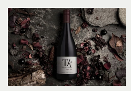
Te Kairanga Martinborough