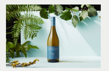
Grove Mill Wairau Valley, Marlborough