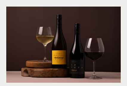
Martinborough Vineyard Martinborough